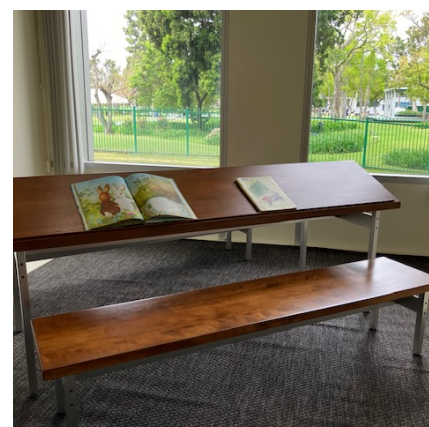
Original children's reading table displayed in Hunt's Mid-Century Room